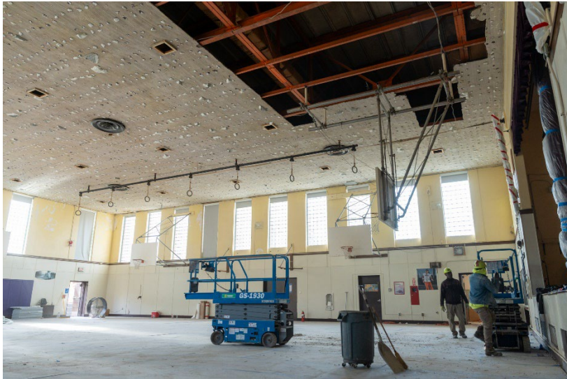
PS 16 – Gym, main stair, pool infill