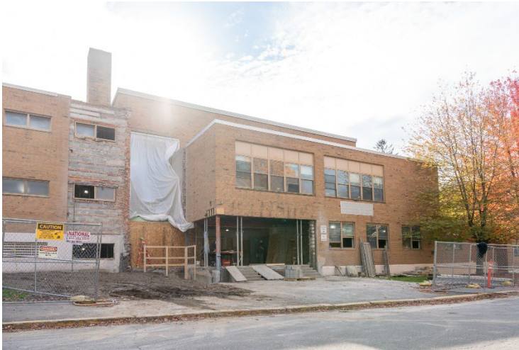
PS 16 – Exterior, Main Office